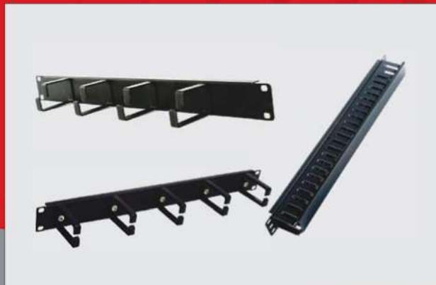
Cable Manager (MS & PVC)