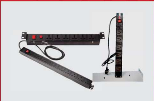
Power Distribution Unit