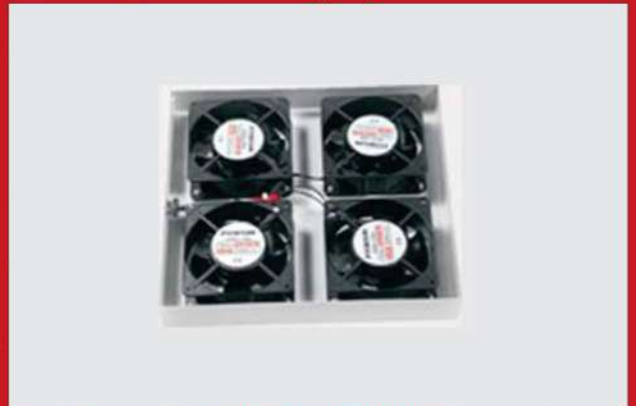
Fan Housing Unit (FHU)